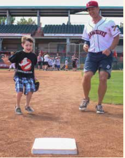
Erie SeaWolves players and coaches provided hands on instruction in batting, catching and running the bases.

The Barber National Institute, the Erie SeaWolves, and the Siebenbuerger Club came together to provide day-long day baseball clinics at Jerry Uht Park. Nearly 50 adults in day and residential programs participated in a clinic on July 18, while children in Connections Camp, a recreational program for youth ages 5 - 17 with high functioning autism and