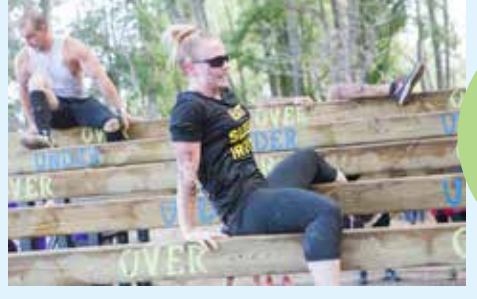
One of the new obstacles – and a favorite – Over Under.